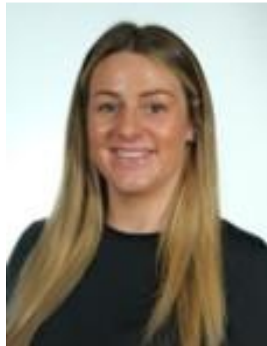
Miss Maldon Dolphins