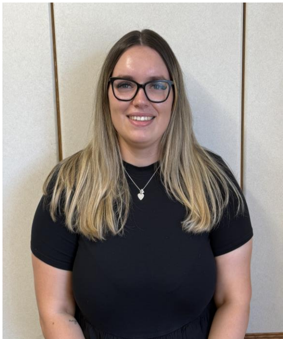
Miss Culver Narwhals